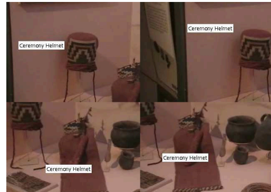
Figure 3. Test: tracking objects "Ceremony Helmet", courtesy of Archaeological Museum San Miguel de Azapa, Arica Chile.

To perform the tests objects that are more representative here used. These objects are 1, 2, 14 and 16.