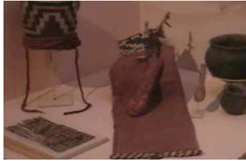
Figure 2a. Image where the object of interest is selected.

spurious points by robust estimates and proximity.