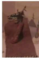
Figure 2b. Object of interest.