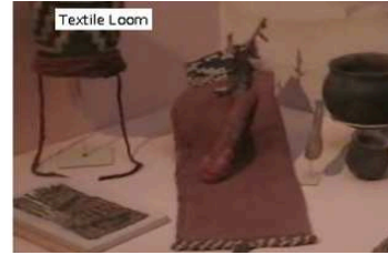
Figure 2c. Annotation associated to the object of interest.

From these points we have the conditions to insert the annotation associated to the object of interest, using the process described in the system's architecture.