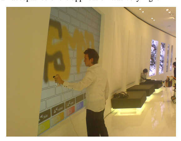
Figure 9. Natural Interfaces: Virtual Graffiti on the International Motor Show (IAA, Sept. 2007).

For evaluating usability and robustness of the interaction method a pure entertainment scenario for spraying graffiti, quite popular for adolescents, was developed, which was shown at the IAA 2007 in Frankfurt/ Germany (Figures 8, 9). Here the interaction device is an optically tracked aerosol can with a joystick axis as spray nozzle. This device is not only well known to everybody, but it can also be regarded as being fully immersive in the context of the application, because its usage intuitively maps to the real-world experiences of the users. Just as in reality they simply point towards the wall and press the button for painting. The farther away they are, the worse the blob detection works, because the light of the LED gets too weak – but it doesn't matter, because it's exactly what they would expect from an aerosol can. And by using a joystick axis instead of a button, another typical effect can be achieved: The stronger the nozzle is pressed, the more intense the color is. Hence, the users were able to produce nice images and the overall acceptance of the application was very high.