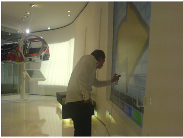
Figure 8. Left: Tracked aerosol can with IR-LED. Right: Spraying "graffitis" intuitively with it.

The calibration process is easy and always the same, independent of the chosen input device. First three given points on the screen, defining the viewing plane, are selected successively. Then, because 2D information is sufficient, the plane with maximum projection is determined. This is done by calculating the coordinate with the highest absolute value of the plane normal. By only using the other two coordinates in subsequent calculations and doing a simple window-viewport transformation beforehand based