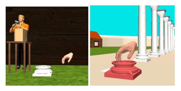
Figure 6b. Corresponding 3D interaction (transporting task from stonecutter to building shell).

Furthermore, the additional 2D part has the great advantage that on the one hand text is much better readable compared to (especially stereoscopic) 3D applications, and on the other hand that tests are easily to integrate by using common techniques well known from CBT/WBT applications. The 2D part is also useful for providing information, which cannot be embedded expediently into the virtual world and therefore cannot be decoded without cognitive effort.