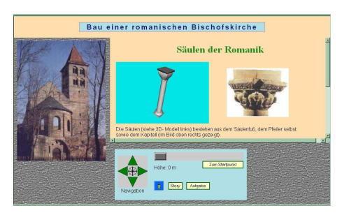
Figure 6a. Additional textual and multimediabased information in a web browser.

Interaction can be accomplished in many ways. First an indirect interaction type, as realised in scenario A is explained. Here the scenario is divided into two parts, a 3D virtual world (see Figure 6b; the red colour of the pedestal is a feedback that indicates that the target position isn't reached yet), and a 2D web based part (Figure 6a, above). The latter not only serves as an additional knowledge base with textual information and other multimedia content like videos, pictures and sketches, but - in order to alleviate the above mentioned problems concerning VR-devices in the sense of an "augmented" VR - also, as our tests have shown, as a very efficient means for navigating through and interacting with the virtual environment. An easy-to-use and -understand navigation panel is shown in the lowest frame of the web interface.