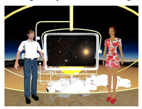
Figure 7. A VLE for learning astronomy by talking to virtual characters via speech input.

Especially in the context of language learning and social sciences one of the most direct types of interaction is the communication with a virtual character, but rendering has a lot of challenges: Flexible control of the character requires a flexible animation system including body movements and mimics, which is still an open area of research, besides the problem, that the quality of low-cost TTS systems is not convincing - which was a problem in Scenario B. Realism also means to have realistic models and gestures. Finally everything has to be done in real-time, because the interface must react immediately to user input. It has been shown [Mart89], that utilizing pointing devices in combination with speech input can lead to an increase in performance of up to 60 percent compared to only using pointing devices, but currently speech recognition systems are expensive and have to be trained, what contradicts the intended use, and still work best for grown-up males and worst for girls.