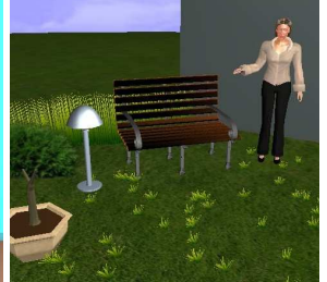
Figure 2. Language learning with virtual characters by responding through solving the tasks.