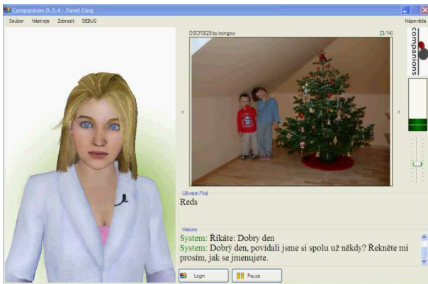
Fig. 2. Application screenshot.

the embedded Internet Explorer window with the embodied avatar (see the section V for details), the window with a photograph that is being discussed and finally two windows showing the current user/avatar utterance (depending on whose conversation turn is actually taking place) and the history of dialogue turns.