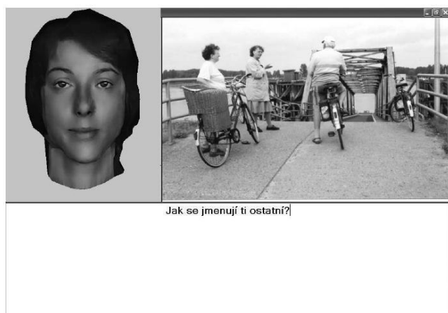
Figure 3 Snapshot of the presenter

In Figure 3, there is shown a snapshot of the screen which was presented to the object as a visual communication interface of the dialogue system.