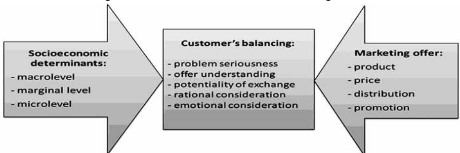
Fig. 1: Consumer behaviour and decision making model