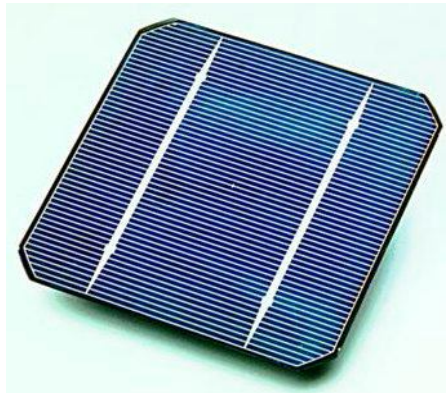
Figure 1 - Solar cell

Solar hot water – Sun we can use for heat water and used this water in buildings and swimming pools. Solar collector is mounted on the roof. He consists of a thin, flat, rectangular box with a transparent cover that faces the sun. Small tubes run through the box and carry the fluid (in this case water). The tubes are attached to an absorber plate. Plate is painted black to absorb heat. This heat heats the fluid passing through the tubes. The storage tank then holds the hot water.