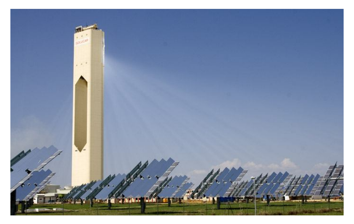
Figure 3 – Solar power tower

• A power tower system - uses a large field of mirrors to concentrate sunlight onto the top of a tower, where a receiver sits. This heats molten salt flowing through the receiver. Then, the salt's heat is used to generate electricity through a conventional steam generator. Molten salt retains heat efficiently, so it can be stored for days before being converted into electricity. That means electricity can be produced on cloudy days or even several hours after sunset [2].