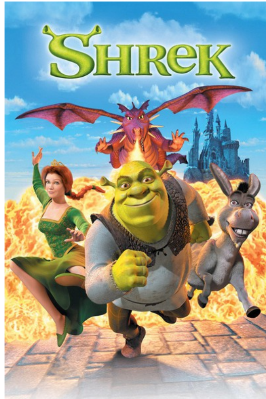
Pict. 7 . Shrek