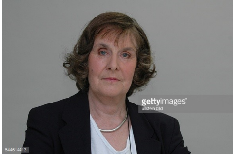
Pict. 4. Juliane House