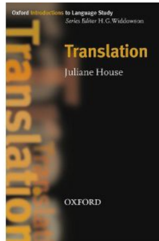
Pict. 5. Juliane House – Translation