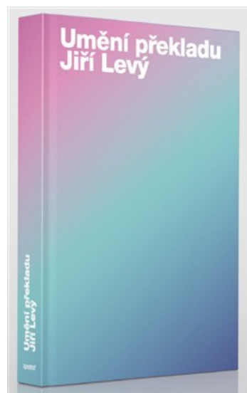
Pict. 2. Jiří Levý – Umění překlada