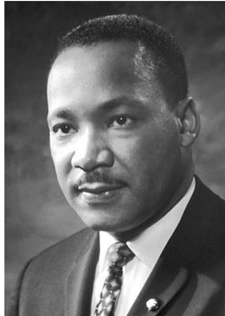
Pictures 5 and 6 - Adam Clayton Powell, Jr. on left, Malcolm X on right