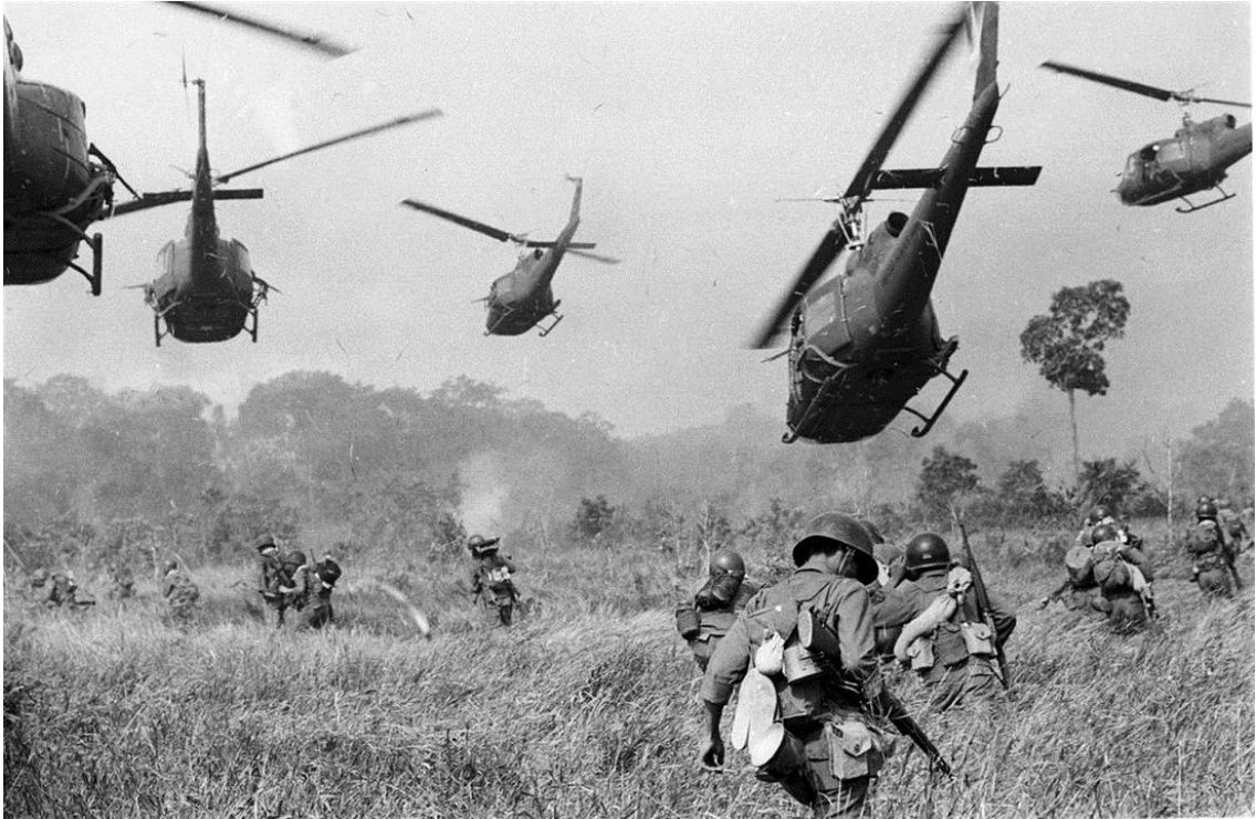
Picture 10 Helicopter Attack