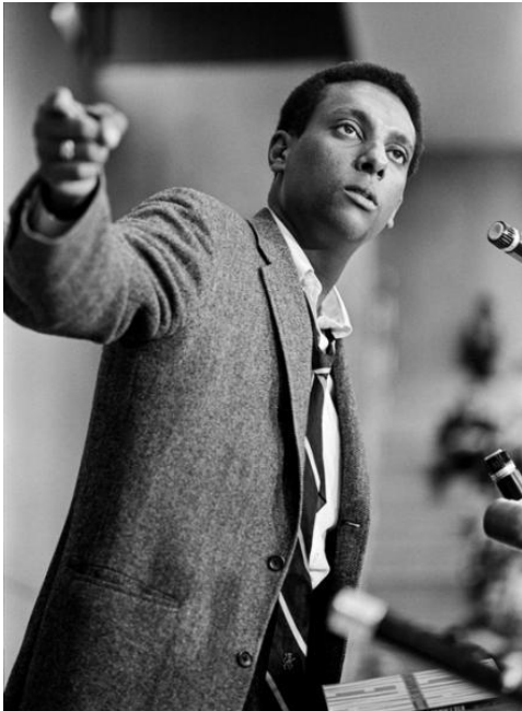
Pictures 3 and 4 - Stokely Carmichael on left, Martin Luther King Jr. on right