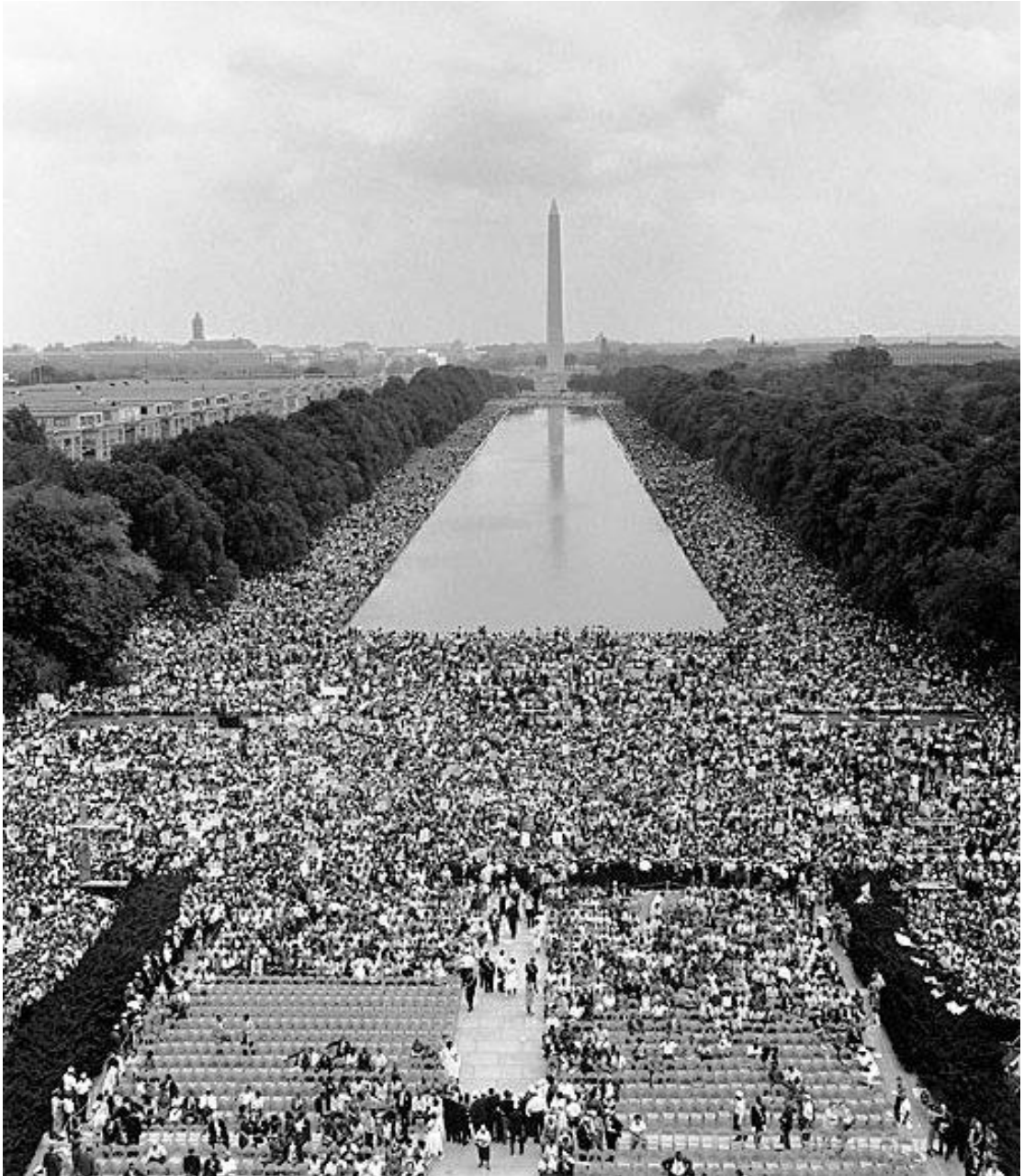
Picture 9 View from the Lincoln Memorial toward the Washington Monument