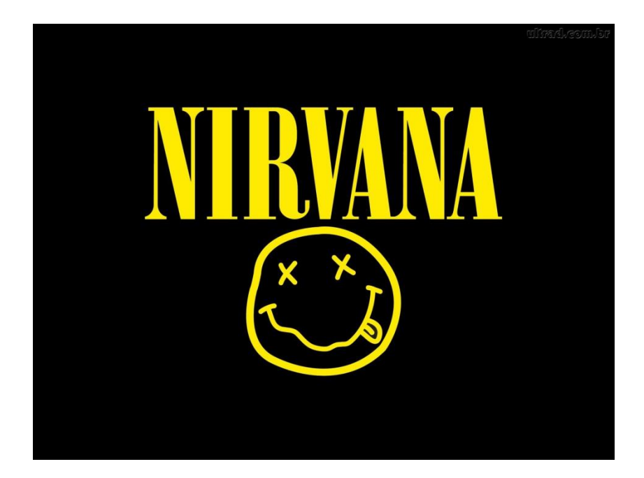
Nirvana's logo [146]