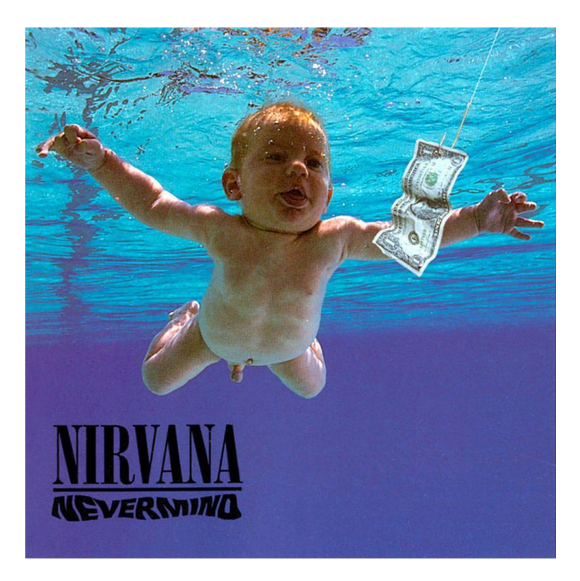
Their most famous album – Nevermind [147]

Underneath the bridge The tarp has sprung a leak And the animals I've trapped Have all become my pets And I'm living off of grass And the drippings from the ceiling It's okay to eat fish 'Cause they don't have any feelings