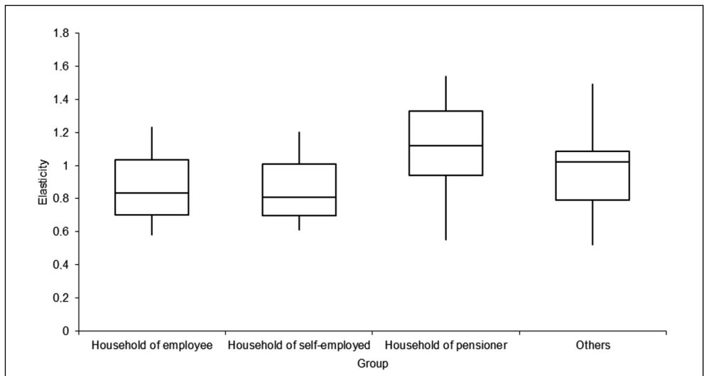
Fig. 2: Box plot of elasticity of households according to economic status

The examination of the households classified by an economic activity of their head has shown that in the households with an employed