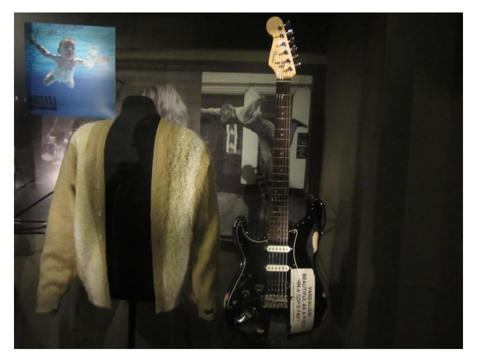
Michal Nováček. 2016. Kurt Cobain's guitar and pullover [photograph]. (author's own private collection)

Michal Nováček. 2016. Bleach recording contract [photograph]. (author's own private collection)