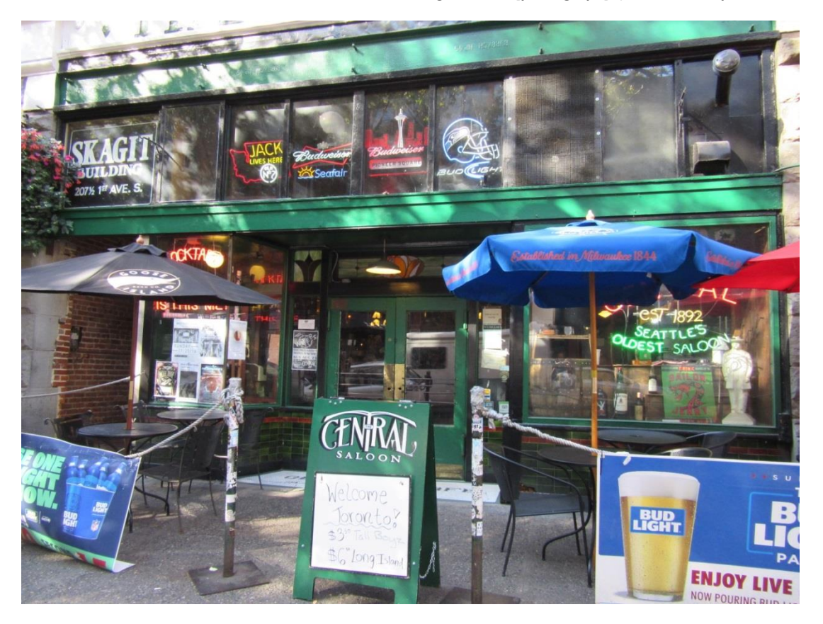
Michal Nováček. 2016. Central Saloon - one of the still working clubs Nirvana played [photograph]. (author's own private collection)