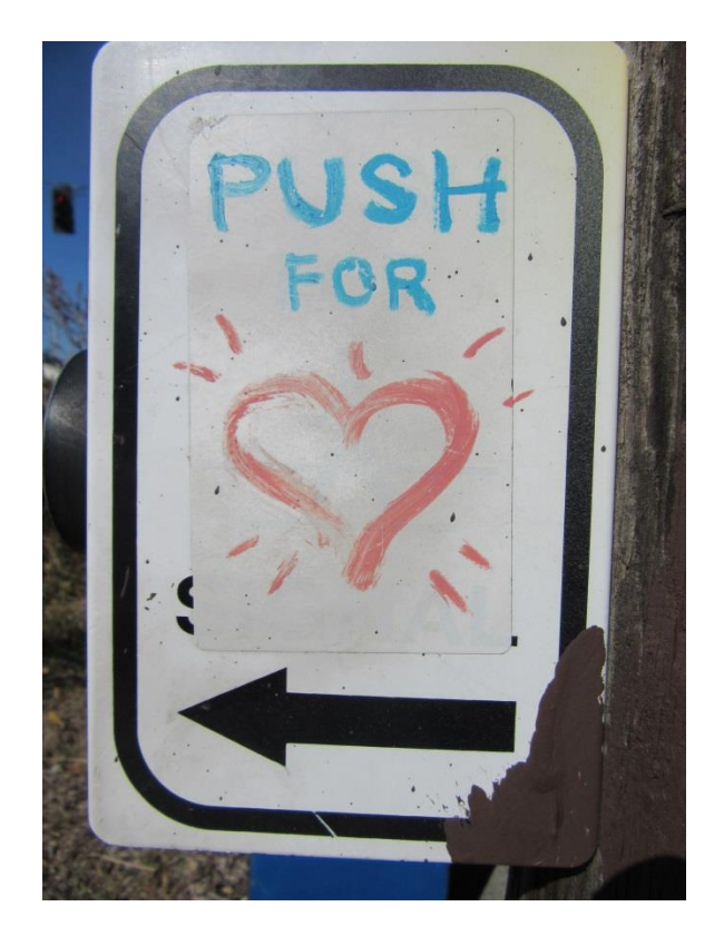
Michal Nováček. 2016. Genuine Seattle on the traffic light button [photograph]. (author's own private collection)