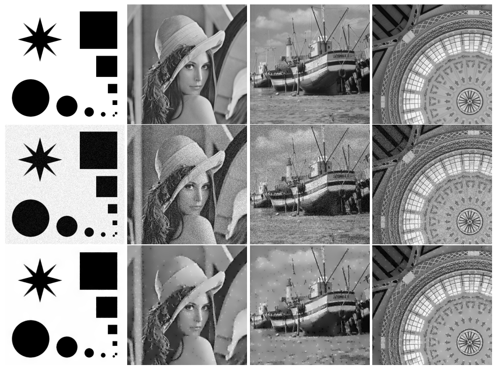
Figure 4: From top to bottom: the original images, the noisy input images ( \sigma = 0.1 ), and the obtained output images. From left to right: Test9, Lena, Boat, and Mercado512<sup>3</sup>.