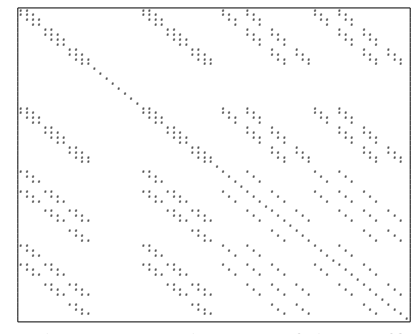
Figure 3: The non-zero elements of the coefficient matrix in the linear vector-valued subproblem (19) when the sparse numbering scheme is used (4 \times 4 \text{ grid}) .

the dense numbering scheme) is chosen, then the coefficient matrix in the linear vector-valued subproblem (19) is of the form shown in Figure 2. On the one hand, if the numbering scheme shown on the right (referred to hereinafter as the sparse numbering scheme) is chosen, then the coefficient matrix is of the form shown in Figure 3. Each numbering scheme has its own advantages and disadvantages.