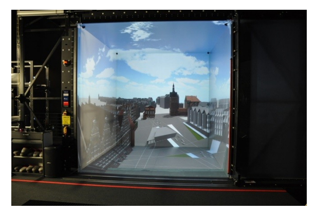
Figure 6. The virtual Coal Market Square.