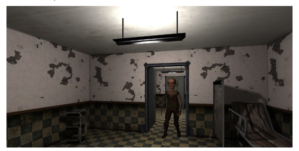
Figure 10. Escape from zombies.

I3DVL is a very attractive platform for the development of games focused on movement through different terrains. We present a game made by students, taking place in an old hospital, where a player escapes from zombies (Fig. 10). The main focus of this game was to test different navigation schemes. For example, the forward direction could be determined based on the direction a player is looking, or the direction he is pointing the controller. Another option was to use the player's position in the VR cave (i.e. how much off-center they are and in what direction).