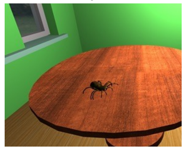
Figure 9. Virtual implosive therapy.

A number of anxiety disorders and phobias can be treated through controlled exposure to the real phobic stimuli (flooding technique) or to its image in the patient's brain (implosive therapy). In I3DVL, virtual stimuli can be used instead or real or imagined ones. For example, arachnophobia can be treated by controlled exposure to a virtual spider in different forms and situations (Fig. 9), peristerophobia – to a virtual pigeon, glassophobia – to a virtual crowd, acrophobia – to a virtual height. Wandering on virtual ledges and floors of a skyscraper allows a patient to overcome their fear of heights.