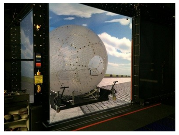
Figure 2. Spherical walk simulator in the middle of VR cave in I3DVL (with open gate).

The Immerse 3D Visualization Lab contains the spherical walk simulator Virtusphere [17] that has the form of a transparent (openwork) sphere rotating on rollers. It can be inserted into the center of the virtual reality cave (Fig. 2) and is entered afterwards through a manhole. The user sees images that are projected onto the screens surrounding the rotary transparent sphere. The diameter of the sphere is equal to 3.05 m and provides a sufficiently large radius of curvature, therefore the abnormality of movement will be imperceptible or at acceptable levels [10, 12]. Moreover, the user's head is almost in the geometrical center of the sphere.