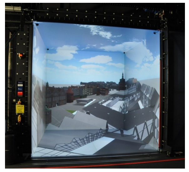
Figure 1. VR cave in I3DVL (with open gate).

The Immerse 3D Visualization Lab contains a virtual reality cave in the form of a closed cube with edges of about 3.4 meters each. It consists of six square screens: four vertical walls, a horizontal floor and a ceiling. All screens are two centimeters thick acrylic plates with special coating for highest brightness uniformity. The floor is strengthened with an eight centimeters thick glass plate with a carrying capacity equal to 700 kg (7 persons). To allow users entrance to the VR cave, one of the screen-walls is an automatic sliding gate (Fig. 1).