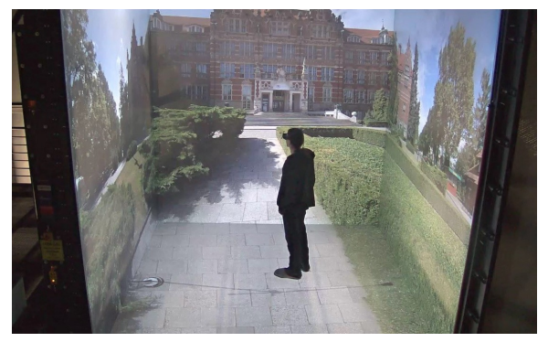
Figure 11. Real scene projected onto cave screens.

I3DVL can display not only a virtual, computergenerated world, but also photos and video recordings (Fig. 11). This can also be done in real time, allowing users to feel as if present in a distant, possibly dangerous, place. Telepresence could be used to control robots, giving the operator 360 degree view (assuming the robot has appropriately placed cameras). This would be immensely useful for operations in dangerous environments, but also any other situation where the user cannot be physically present at the chosen location.