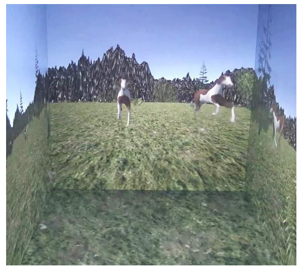
Figure 3. Virtual horse catching simulation.

It is much cheaper and safer to simulate battlefields and rescue operations (such as fires, floods, earthquakes) with virtual reality, as opposed to real training grounds. Infantrymen, firemen and other specialists can train the procedures using virtual reality. I3DVL has not yet had the opportunity to cooperate with uniformed services, though we do have a number of indoor and outdoor locations modeled. Some of them include scripted events, objects that can be interacted with, as well as AI controlled agents. One example is a student's application where one can attempt to catch horses on an enclosed meadow (Fig. 3).