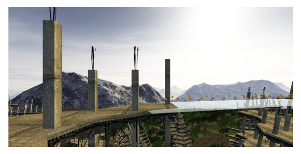
Figure 8. Acrophobia treatment by gamification.

University of Social Sciences and Humanities developed scenarios for a game that should help in the treatment of acrophobia (fear of heights). Two applications were developed by students, one where a person can ascend high skyscrapers to measure at what heights he begins to feel uncomfortable. The other included coins placed on rooftops, ledges and glass bridges and measured fear of height by the number of coins a user was able to collect (Fig. 8). This could provide psychologists with valuable insight. While final versions of this software prevented people from actually falling off the edges, the ones that allowed it showed varying levels of reaction from people, with some people largely while others experienced unaffected. strong emotions.