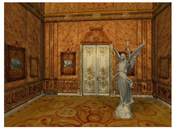
Figure 7. The virtual Amber Room.

A masterpiece created by eighteenth century craftsmen in Gdańsk, the Amber Room, was considered one of the most valuable works of art ever created in Europe. Until it's mysterious disappearance during World War II, it's history took place in Berlin, Tsarskove Selo (for over two centuries) and finally Königsberg. It took 24 years between 1979 and 2003, to reconstruct the room in Tsarskove Selo, although there was a major division between the craftsmen over the question whether the new room should be artificially aged, with the proponents ultimately winning. In I3DVL we can admire the Amber Room as an example of immersive virtual tourism (Fig. 7). This also shows how the laboratory could be used by museums to plan and test expositions before building them, or by artists who might want to see how their sculpture or other form of art might look in a specific room, or even how changing the different parameters (such as material or age) would affect the final look.