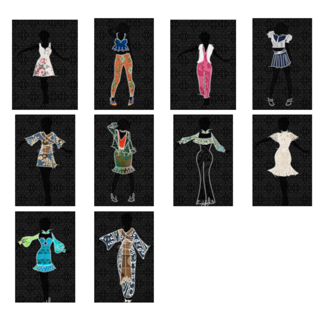
Figure 3: Results.

Currently our system only works well with the image that satisfies the three requirements listed as follows.