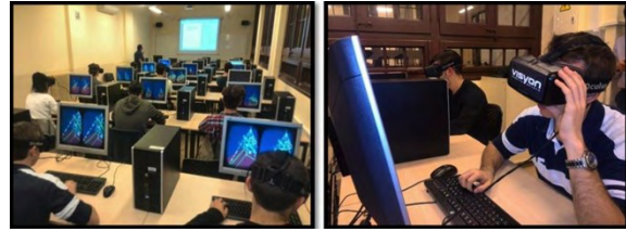
Figure 2. VR sessions.