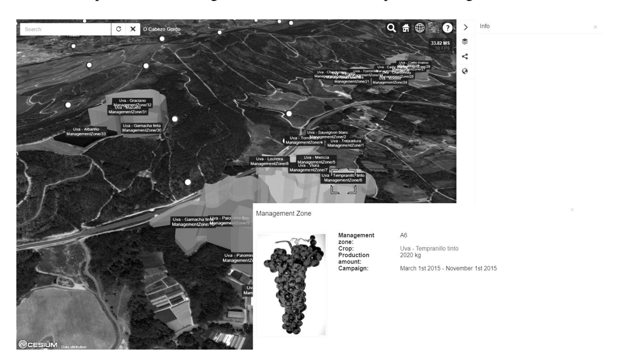
Figure 4. Linked data integration to 3D virtual environment

displayed together with the linked data from dbpedia<sup>14</sup> and other semantic sources. The aim of this example is to show integration of linked data and spatial data together.