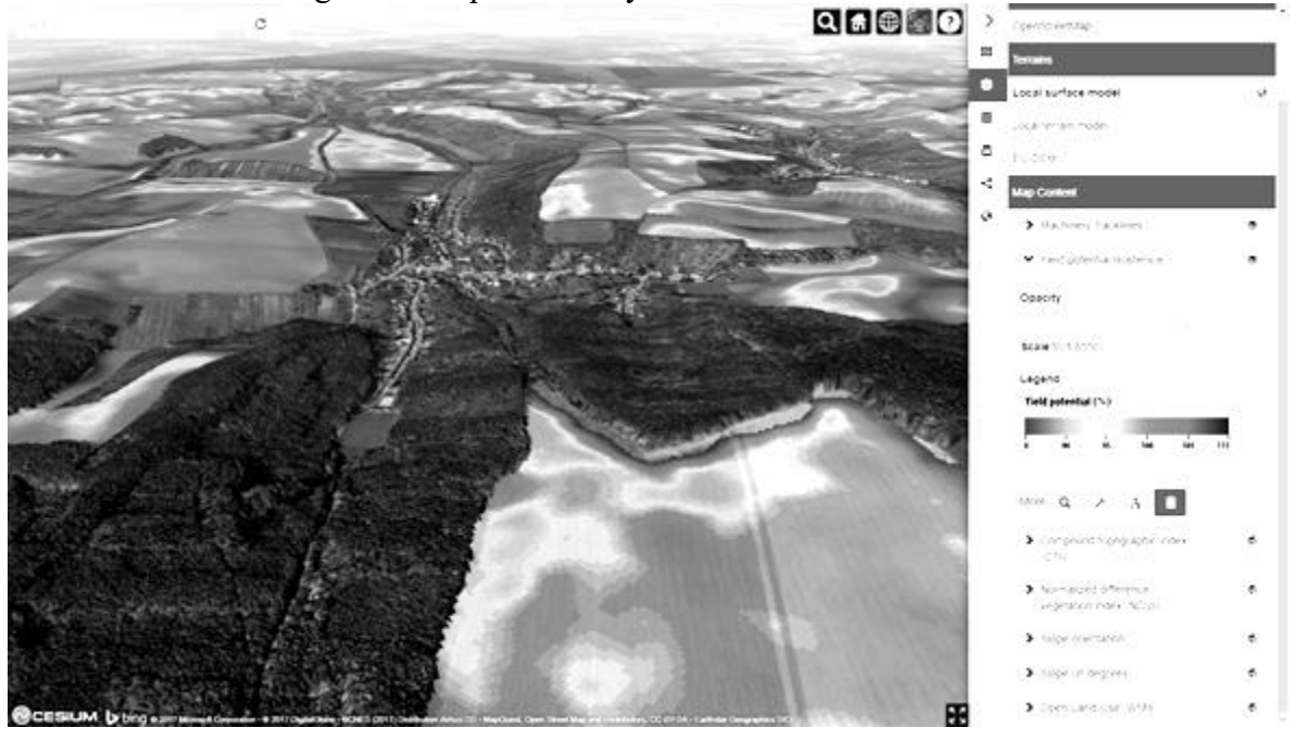
Figure 3 Rostěnice Farm Visualisation

The application uses a digital terrain model of fifth generation and the digital surface model of first generation produced by \check{C}\check{U}ZK^{13} .