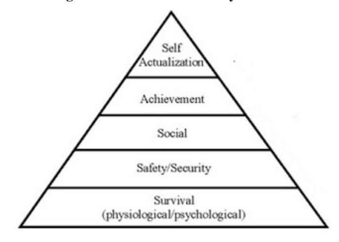
Figure 3: Maslow's hierarchy of Needs

Abraham Harold Maslow, who proposed this Hierarchy of Needs, was US social psychologist. He thought up a pyramid of basic needs. This model achieved a high citation. The pyramid is about motivation theory which contains five levels of human needs which must be satisfied in a strict time and they started with the lowest level. The levels are not related to each other. The lowest level are psychological needs such as paying for food, living and generally to stay alive. These needs are the major customer contents. The safety needs follow which means to feel the safety and protection for example of families. Then come social needs that are related mainly to love and belonging. Another level of Maslow 'Hierarchy of Needs are esteem needs. They are connected with feeling worthy, maintaining a life style, being respected and to have a social status. Self-fulfiment or self-actualization needs are the needs to become actualized to in what somebody is and also refer to demand satisfaction. There is a huge range of this type of needs.<sup>42</sup>