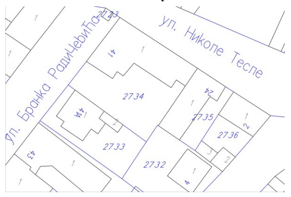
Figure 2. A sample from a vectorized cadastral map from the time of Mary Theresa (corresponding to the map in Figure 1)

There are many studies that deal with map vectorization [Boa92], [Ill91], [Con97], but the first that attempts to use neural networks to solve the complex problem of the digitization of Chinese cadastral maps and automatic extraction of high-level information was done by Chen et al. in 1996 [Che96]. The system they had developed at the time, consisted of three main parts: the separation of text and graphics, extraction of parcels and recognition of rotated characters. Even though the text and graphic separation and parcels extraction was not done by machine learning methods, they were among the first ones to propose a neural network approach to the recognition of Chinese hand-written and rotated characters. The used neural network was a two-dimensional Hopfield neural network [Hop82] which was able to reflect the degree of similarity of the test characters to previously stored templates in the final states of neurons.