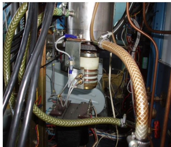
Fig. 1 Parts of the HF CVD system below the vacuum jar. One can see the rotary mechanism, sliding annular contacts, outputs of the thermocouples (grey cables) and temperature compensation (blue connection).

synthesis of carbon nanotubes was described in detail in [1-3]. The main problem lies in deposition of conductive impurities on the thermocouples, which leads to a decreased accuracy or complete failure of temperature measurement. Another problem is the interruption of the \pm 12 V voltage from the external supply due to unreliability of the sliding annular copper contacts between the