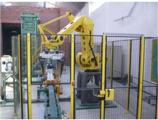
Figure 2. Traditional industrial robot locked in a safety cage [ARC Robotics 2019]

An example of a traditional industrial robot locked in a safety cage is shown in Fig. 2.