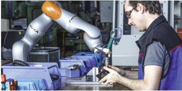
Figure 3. Collaborative robot [Belanger-barrette 2015]

As mentioned above, the main difference between traditiona industrial robots and collaborative ones is their collaboration with human operators. This is also linked to their location in the work place. The design of collaborative robots respects their collaboration with human operators. Collaborative robots are equipped with detection sensors and special safety functions to recognize the contact or even the location of a human operator. The potential contact surface of a collaborative robot is also usually made of safe materials to absorb energy. Some collaborative robots are even programmed to shut down immediately if there is a potential danger to a nearby human operator. This eliminates the need for safety cages. Even if collaborative robots are relatively safe, many safety-related problems can arise during the use of collaborative robots, therefore safety requirements need to be analyzed. Traditional robots are not equipped with sensors for detecting human operators, so they need to be limited by safety cages and sensors that are often expensive and prevent easy access. This leads to minimization of potential risks from collision with human operators, but on the other hand it prevents their collaboration. [Poor 2019]