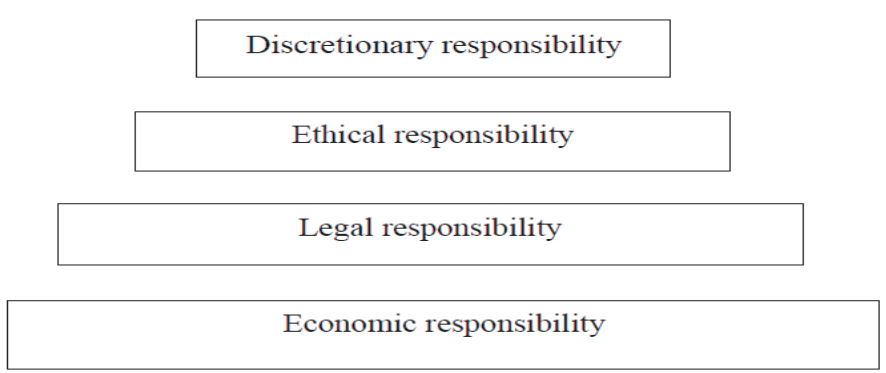
Figure 1: Pyramid of Corporate social responsibility

Carroll (1979) also had many similarities with this view, offering CSR definition as "the social responsibility of business encompasses the economic, legal, ethical, and discretionary expectations that society has of organizations at a given point in time". Four elements in his definition were later depicted as a 'Pyramid of CSR', which is shown below: