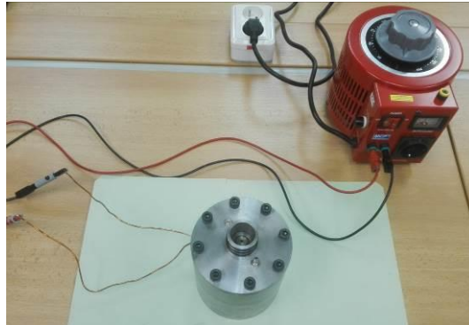
Fig. 3. Assembly for the demagnetization