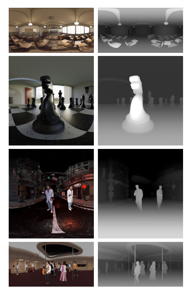
Figure 2. Input views and corresponding depth maps for (from top): ClassroomVideo, Chess, Cyberpunk, and Hijack.

The implementations differ in usage of AVX2 and AVX512 instruction sets, multi-threading (MT), and Independent Projection Targets (IPT) technique which allows to use separate buffers for each thread during depth projection.