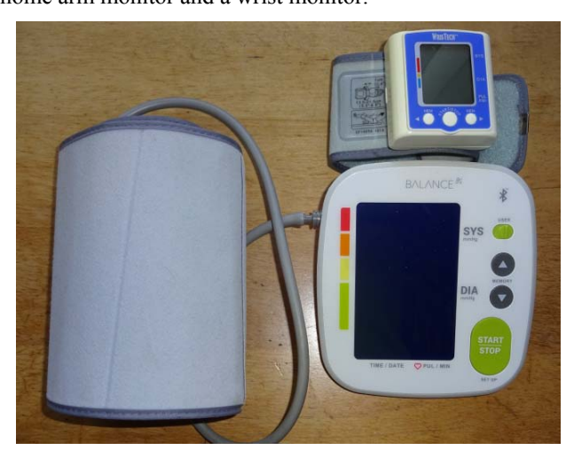
Fig. 1. Arm and wrist home BP monitors

High blood pressure (hypertension) is a world-wide health problem. Measurement of blood pressure (BP) is the most frequently performed health test. It belongs to the family of vital signs. BP measurement is increasingly performed in the home. Home BP monitoring provides useful information to the physician and to the patient [1]. Most recommended home monitors on the market are automatic, with an arm cuff. Wrist home monitors are also popular, but are usually not recommended by experts. The advantage of wrist monitors is small size, low power consumption, and they can usually be used even on very obese people. The disadvantage is that the wrist must be kept at the level of the heart during measurement. When the cuff is not at heart level the BP reading can be artificially higher (cuff below heart) or lower (cuff above heart). Fig. 1 shows a home arm monitor and a wrist monitor.