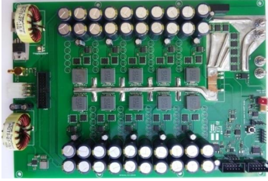
Fig. 2 - Assembled board