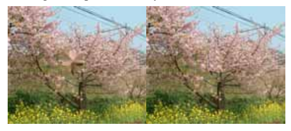
(c) CSRBF (d) Our Combination Approach